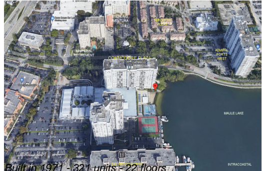
Built in 1971 - 321 units - 22 floors