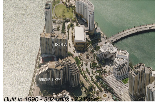
Built in 1990 - 302 units - 23 floors