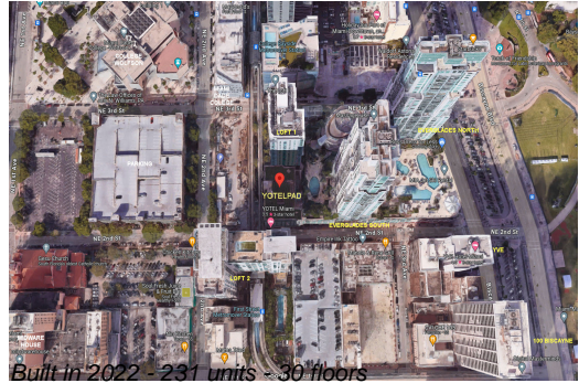
Built in 2022 - 231 units - 30 floors