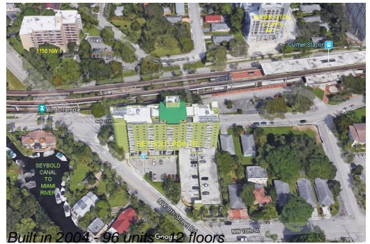
Built in 2004 - 96 units - 2 floors