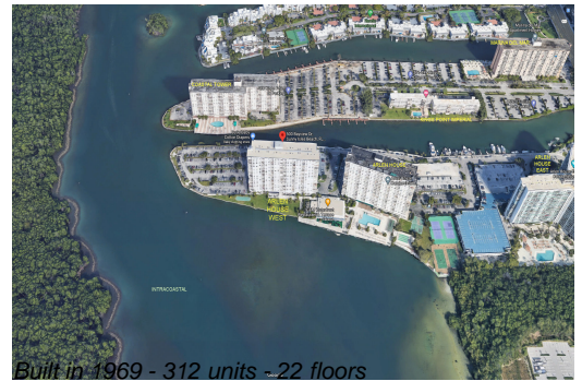
Built in 1969 - 312 units - 22 floors

The above valuated price is a baseline figure that does not take into account any specific renovation, upgrade, split, merge, or deterioration of the unit.