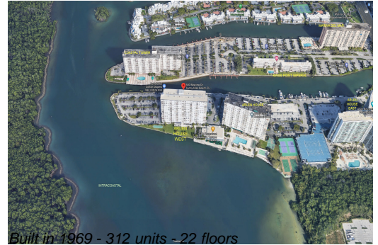
Built in 1969 - 312 units - 22 floors

The above valuated price is a baseline figure that does not take into account any specific renovation, upgrade, split, merge, or deterioration of the unit.