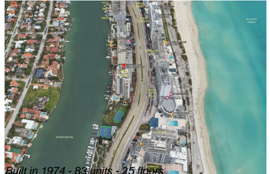
Built in 1974 - 83 units - 25 floors