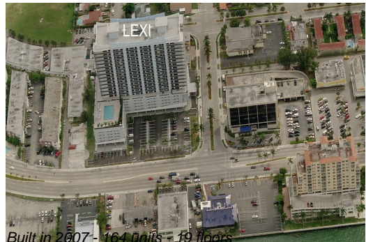
Built in 2007 - 164 units - 19 floors