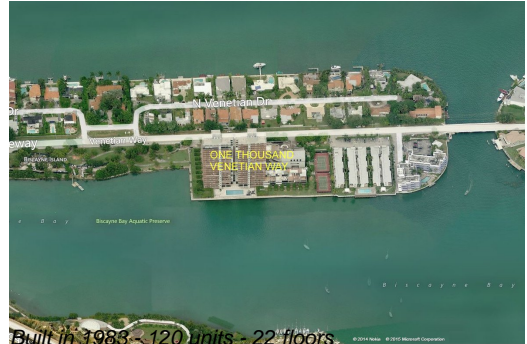
Built in 1983 - 120 units - 22 floors