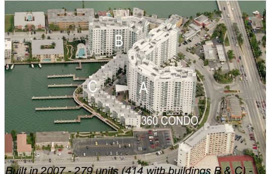
Built in 2007 - 279 units (414 with buildings B & C) - 15 floors