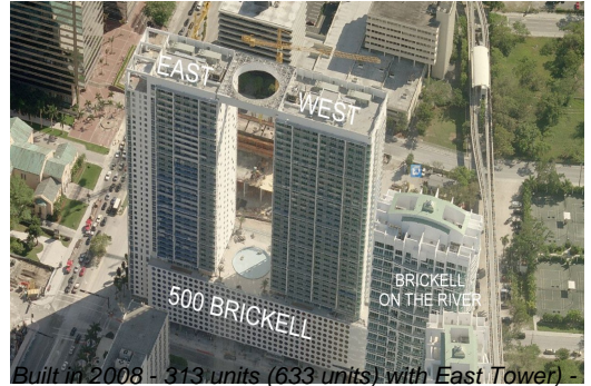
Built in 2008 - 313 units (633 units with East Tower) - 43 floors