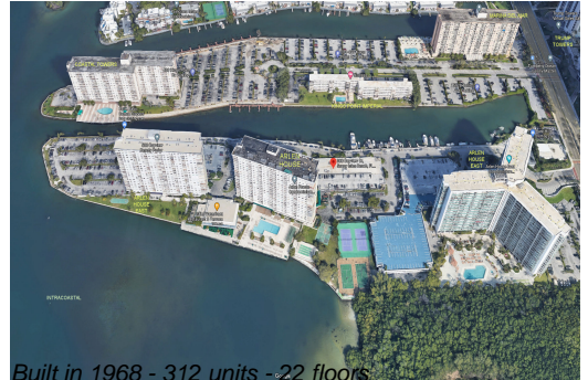
Built in 1968 - 312 units - 22 floors