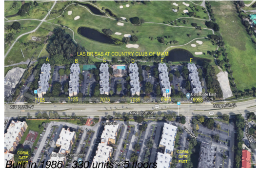
Built in 1986 - 330 units - 5 floors