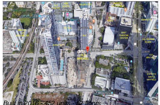
Built in 2016 - 452 units - 65 floors