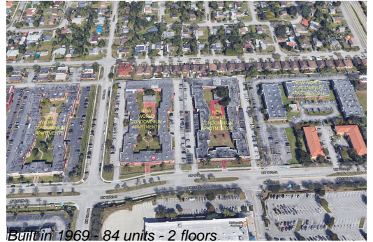
Built in 1969 - 84 units - 2 floors