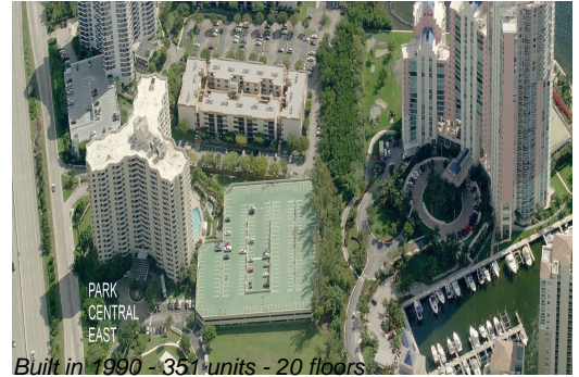
Built in 1990 - 351 units - 20 floors

The above valuated price is a baseline figure that does not take into account any specific renovation, upgrade, split, merge, or deterioration of the unit.