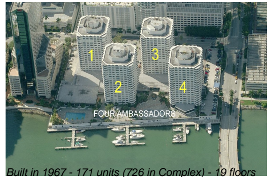
Built in 1967 - 171 units (726 in Complex) - 19 floors