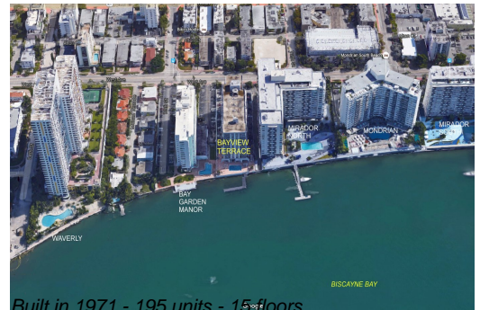
Built in 1971 - 195 units - 15 floors