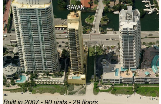
Built in 2007 - 90 units - 29 floors