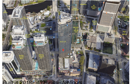
Built in 2018 - 439 units - 58 floors