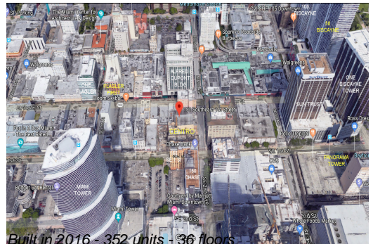
Built in 2016 - 352 units - 36 floors