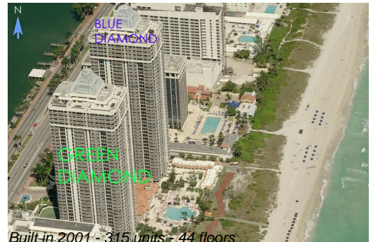
Built in 2001 - 315 units - 44 floors