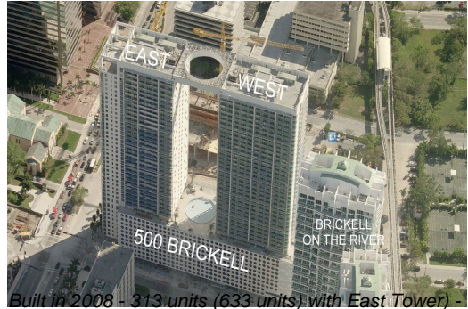
Built in 2008 - 313 units (633 units with East Tower) - 43 floors