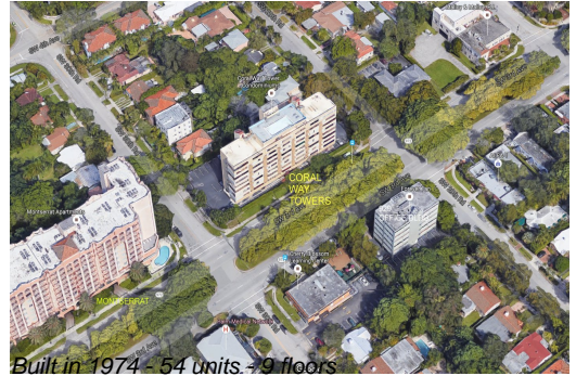
Built in 1974 - 54 units - 9 floors