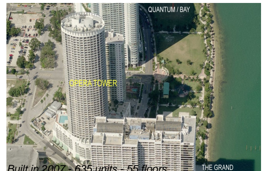
Built in 2007 - 635 units - 55 floors