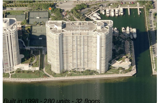
Built in: 1998 - 280 units - 32 floors