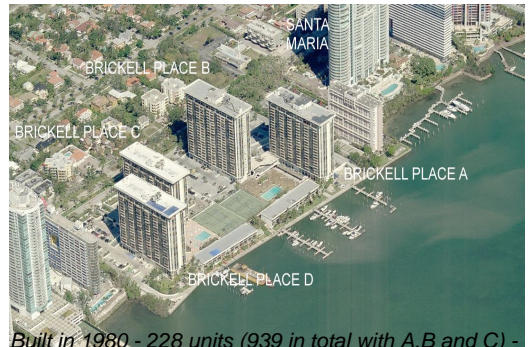
Built in 1980 - 228 units (939 in total with A, B and C) - 23 floors