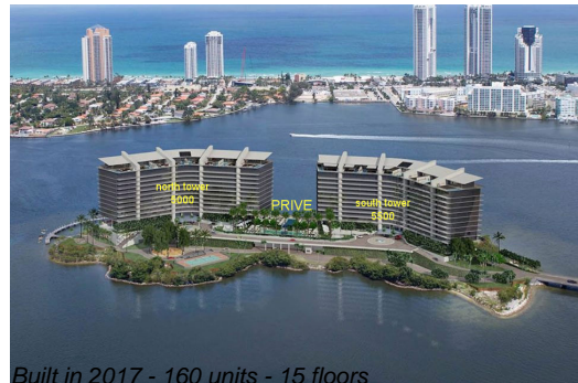
Built in 2017 - 160 units - 15 floors