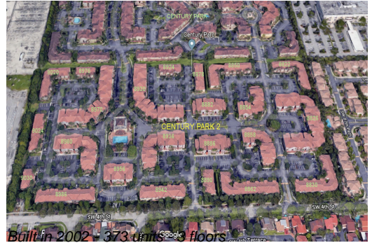
Built in 2002 - 373 units - 300k+ floors