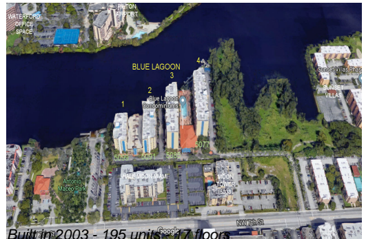
Built in 2003 - 195 units - 7 floors