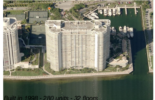
Built in: 1998 - 280 units - 32 floors

The above valuated price is a baseline figure that does not take into account any specific renovation, upgrade, split, merge, or deterioration of the unit.