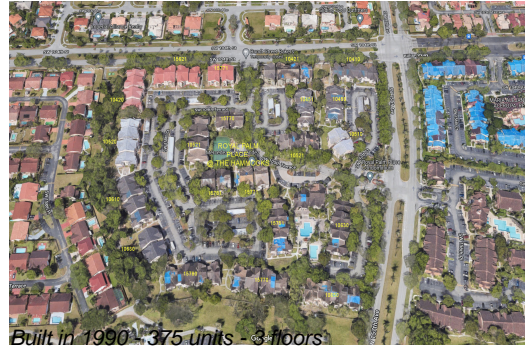
Built in 1990 - 375 units - 3 floors