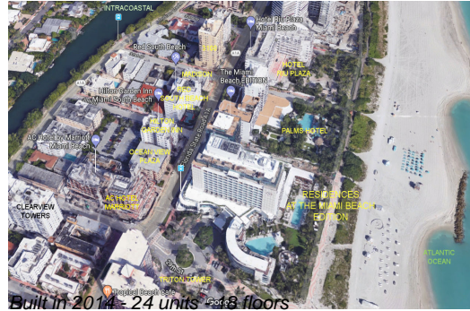
Built in 2014 - 24 units - 48 floors