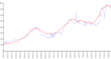
Oceania III vs Sunny Isles