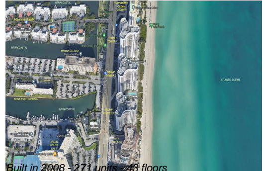
Built in 2008 - 271 units - 43 floors