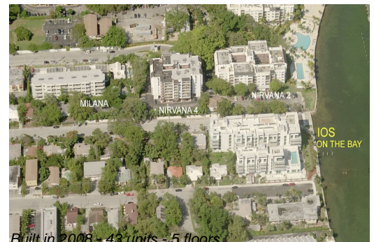
Built in 2008 - 43 units - 5 floors