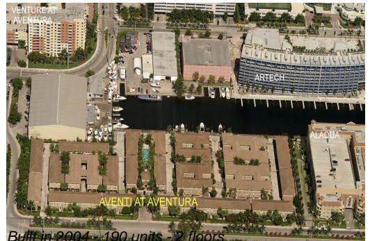
Built in 2004 - 190 units - 2 floors