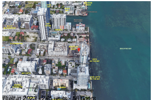
Built in 2023 - 245 units - 58 floors