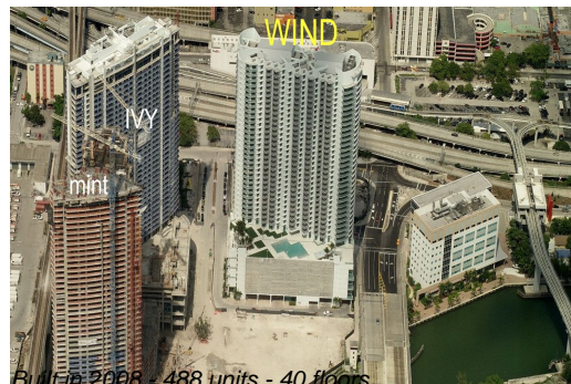
Buildin 2008 - 488 units - 40 floors