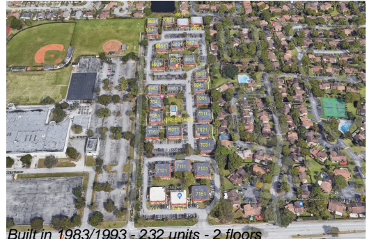
Built in 1983/1993 - 232 units - 2 floors