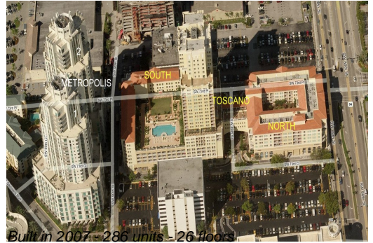
Built in 2007 - 286 units - 26 floors