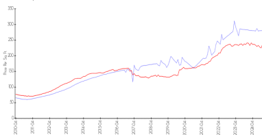
Bayview Palms vs North Miami