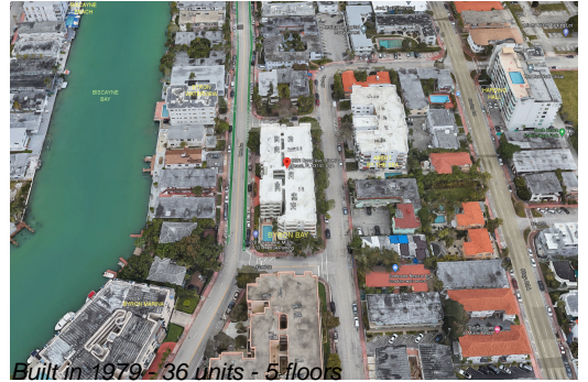
Built in 1979 - 36 units - 5 floors