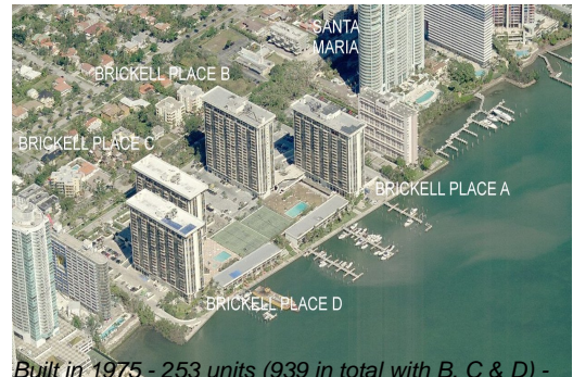
Built in 1975 - 253 units (939 in total with B, C & D) - 23 floors