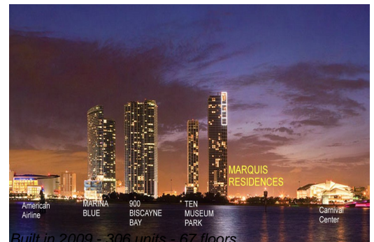
Built in 2009 - 306 units - 67 floors