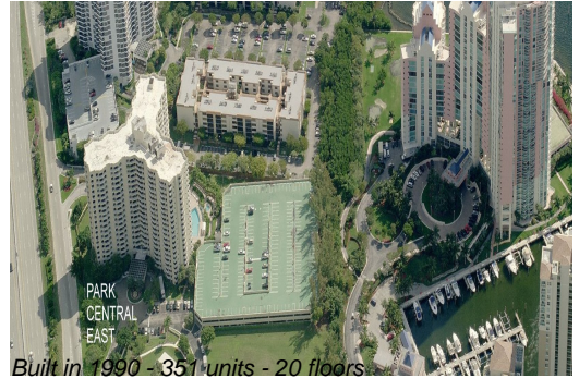
Built in 1990 - 351 units - 20 floors

The above valuated price is a baseline figure that does not take into account any specific renovation, upgrade, split, merge, or deterioration of the unit.