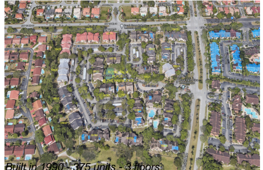
Built in 1990 - 375 units - 3 floors