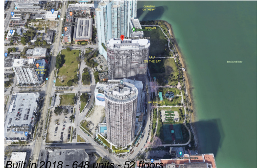
Built in 2018 - 648 units - 52 floors