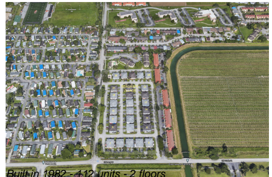
Built in 1982 - 112 units - 2 floors