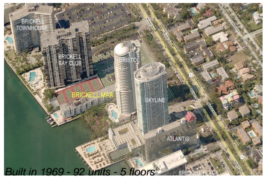
Built in 1969 - 92 units - 5 floors