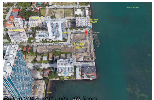
Built in 2017 - 391 units - 52 floors